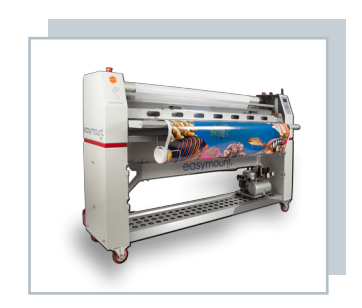
EASYMOUNT WIDE FORMAT SYSTEMS