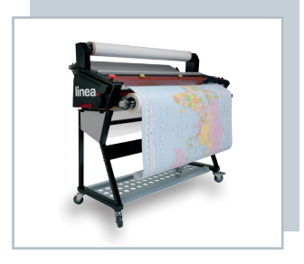
LINEA ENCAPSULATION SYSTEMS