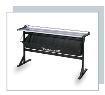
TRIMFAST TRIMMING & CUTTING SYSTEMS