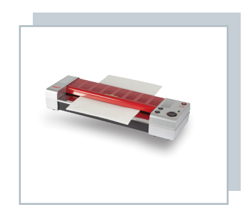
PEAK POUCH LAMINATING SYSTEMS