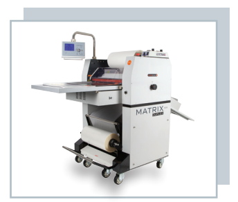
MATRIX LAMINATING SYSTEMS