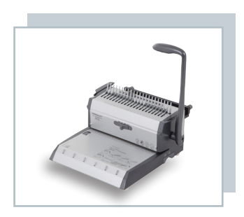
MAGNUM BINDING SYSTEMS