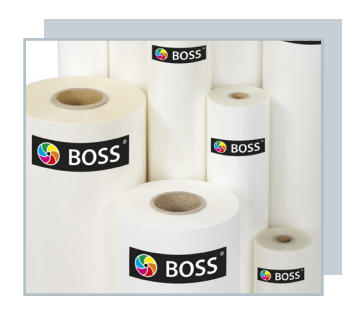
BOSS FILM SUPPLIES

Vivid design and manufacture a wide range of laminating systems, specialising in function, style and reliability.