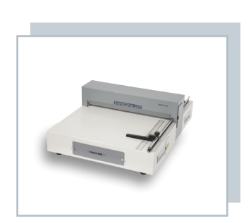
MAGNUM CREASING SYSTEMS